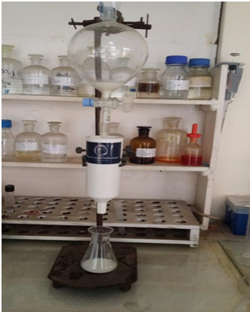
Preparation of treated milk after passing through device one time and three times

To study microbial activity, we select equal volume of raw milk without boiling .One portion was