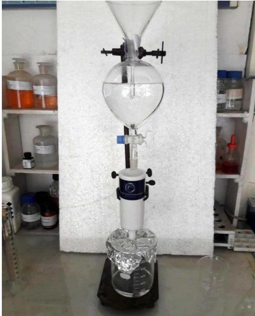
Structure water preparation from given device one time passed and three times passed and marked as QUICK FLOW VORTEX