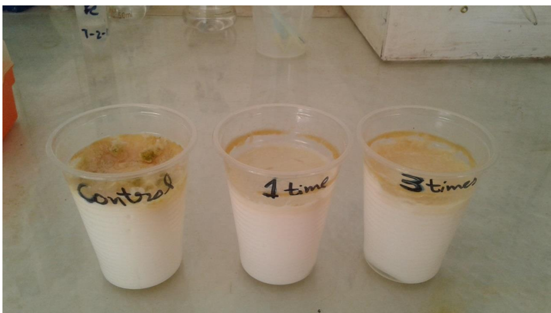
One time passed and three time passed milk have given same results.

microbial attack were found clear. On the other hand microbial growth was appeared on control milk.