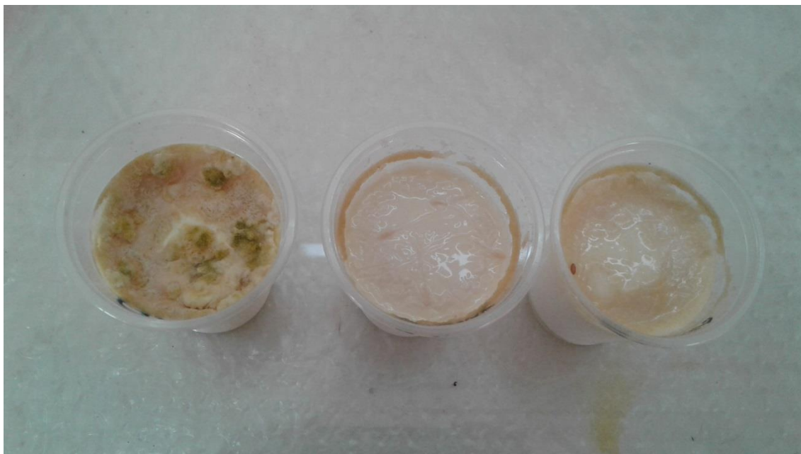
Microbial growth is found on control milk and clear milk can be seen on one time passed and three times passed milk.

After 8 days Treated milk (passed one and three times) were given equal results and were good against